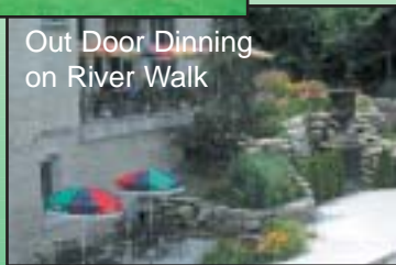
Out Door Dining on River Walk