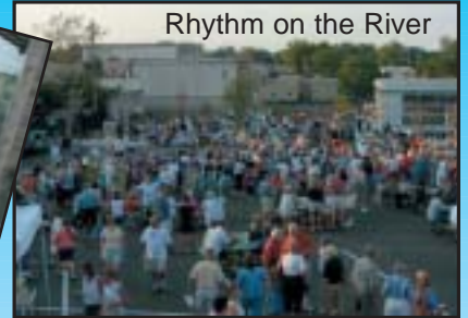
Rhythm on the River