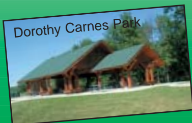
Dorothy Carnes Park